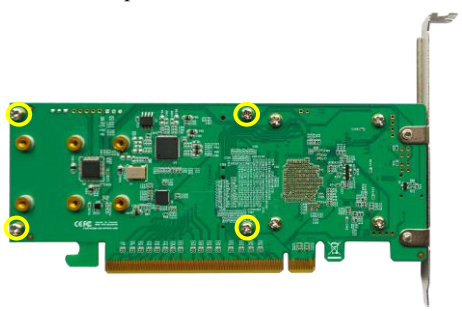
Step 7. On the rear of the SSD7502, refasten the 4 screws that were removed in step 1.

Note: Make sure the heatsink & fan assembly are properly aligned with the controller board (PCB), and that it makes full contact with the thermal pad, before refastening it to the SSD7502. If this assembly is improperly installed, the fan, heatsink and thermal pad will be unable to sufficiently cool the NVMe SSD's and controller componentry, which may result in damage to the SSD's or controller hardware, performance loss, unstable I/O, and the loss of data.