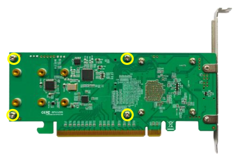
Step 1. On the rear of the SSD7502, remove the four screws that secure the unit's heat sink to the PCB.

After removing the screws, carefully remove the heat sink from the SSD7502.