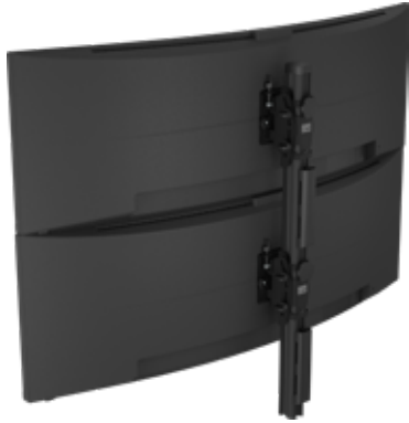
Dual vertical mount using AWM-P40X stackable post, in black.

An alternative post is available with the ability to 'stack' and double in height, AWM-P40X. Use a single layer mount now, with confidence that you can double the post height for an additional ultrawide or other display/s in future.