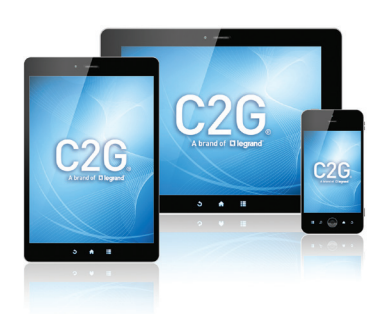
29977 Network Controller for HDMI over IP