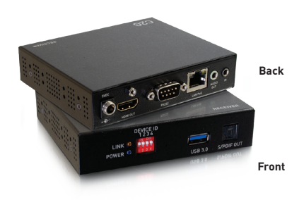
29976 HDMI over IP Decoder - 4K 60Hz