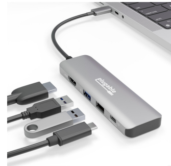
Powerful, Portable USB-C Hub With 100W charging and 4K HDMI

USB C Hub Multiport Adapter, 4 in 1, 100W Pass Through Charging, USB C to HDMI 4K 60Hz, Multi USB Port Hub for Windows, Mac, Ipad Pro, Chromebook, Thunderbolt (USBC-4IN1) Plugable Technologies USB C Hub Multiport Adapter, 4 in 1, 100W Pass Through Charging, USB C to HDMI 4K 60Hz, Multi USB Port Hub for Windows, Mac, Ipad Pro, Chromebook, Thunderbolt (USBC-4IN1). Connectivity technology: Wired, Host interface: USB 3.2 Gen 2 (3.1 Gen 2) Type-C. Product colour: Silver, Data transfer rate: 10 Gbit/s, HD type: 4K Ultra HD. USB cable length: 0.22 m. Width: 115 mm, Depth: 34 mm, Height: 11.5 mm. Quantity per pack: 1 pc(s)