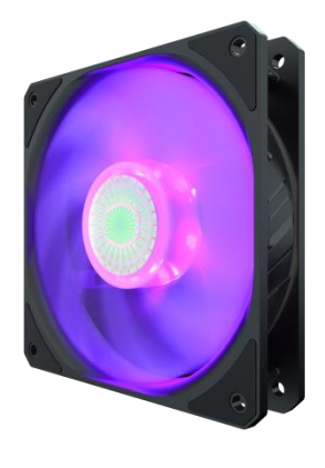
SickleFlow 120 RGB

Improved manufacturing process which will increase the lifespan of your cooler and also prevent leaking.