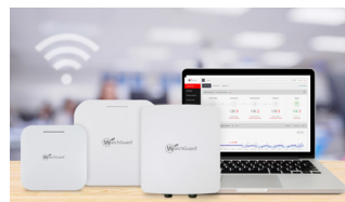
Secure Cloud Wi-Fi