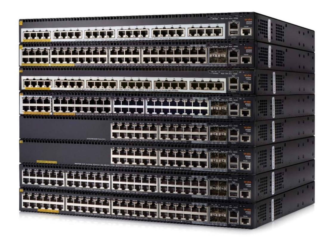
Aruba 2930M Switch Series

The Aruba 2930M Switch Series provides a simple and powerful access layer solution that can be quickly set up at branch offices with little or no IT support using Zero Touch Deployment. The switches include a Limited Lifetime Warranty.