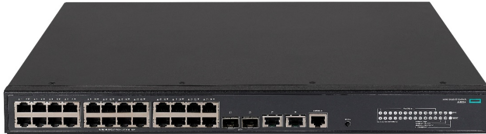
HPE FlexNetwork 5140 24G POE+2SFP+2XGT EI Switch (JL823A)