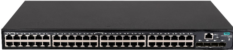
HPE FlexNetwork 5140 48G 4SFP+ EI Switch (JL829A)