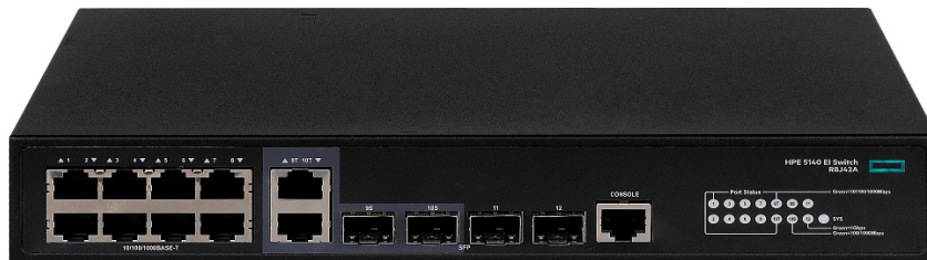
HPE FlexNetwork 5140 8G 2SFP 2GT Combo EI Switch (R8J42A)