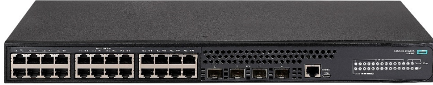
HPE FlexNetwork 5140 24G 4SFP+ EI Switch (JL828A)