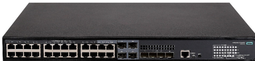
HPE FlexNetwork 5140 24G PoE+ 4SFP+ EI Switch (JL827A)