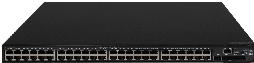
HPE FlexNetwork 5140 48G PoE+ 4SFP+ EI Switch (JL824A)

High availability, simplified management, and comprehensive security control policies are among the key features that distinguish this series.