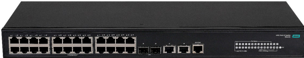
HPE FlexNetwork 5140 24G 2SFP+ 2XGT EI Switch (R8J41A)